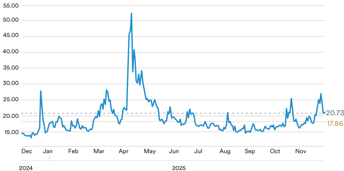
Figure 1 | CBOE Volatility Index